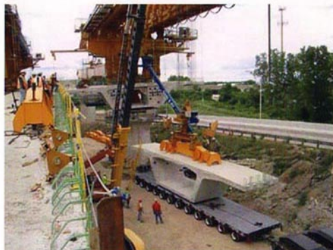
The job has been running smoothly for several months.

The assembly of the bridge is semi-automated by a "launch girder" capable of positioning 14 concrete sections for grouting and cable post tensioning into a span. After the joints cure the launcher can advance itself to assemble the next span.