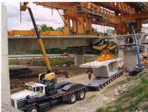
Perkins delivers a concrete segment to the launch girder.