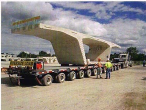
A 202,000 lb. concrete segment on Perkins platform trailers.

A new high level, cable-stayed bridge is under construction over the Maumee River in Toledo, Ohio. Construction of the bridge will take place over the next two years. Perkins was awarded the contract to transport over 2,000 concrete bridge segments.